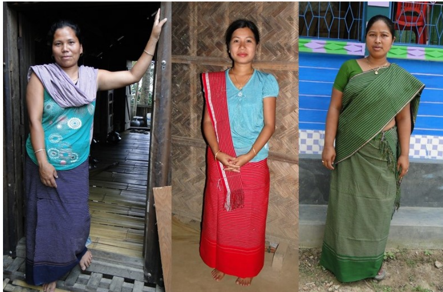
Figure 3. Reang women wearing contemporary costumes in South Tripura District.

As mentioned earlier the tribes were identified by the traditional colour and motifs of the costume. The tribal communities are known for conformity in dressing, a form of social interaction within the tribal community in which one tries to maintain standards set by the group. However, presently the readymade contemporary costume is the same and is worn by tribal women of every community. It was observed that no more we can recognise which village or tribe the women belong to from the costume they wear.