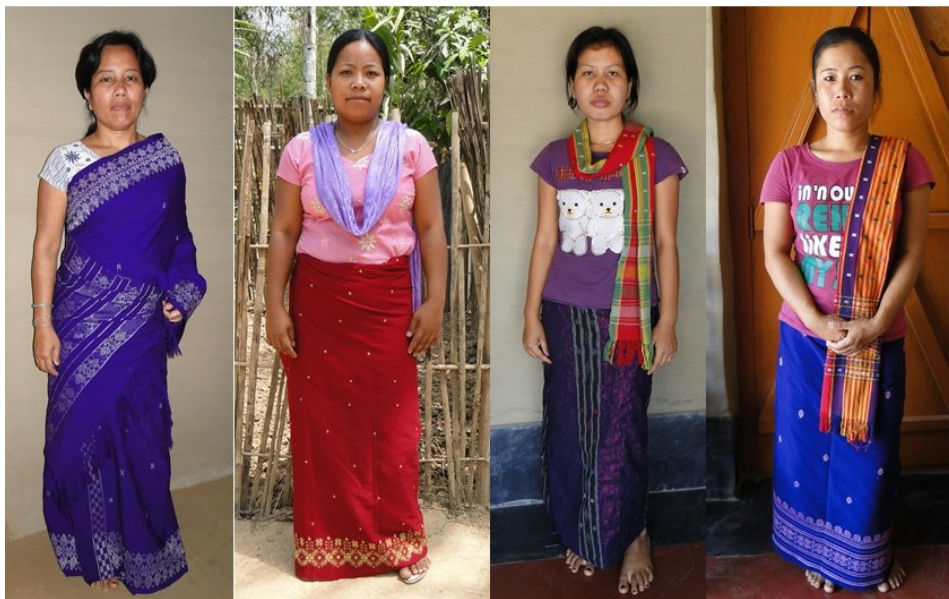
Figure 2. Tripuri women wearing contemporary costumes in West Tripura District.

Traditionally the length of the rigwnai was from the waist to mid-calf, as it was easy to climb the hills, during cultivation. As tribal people shifted to the plains, the length of the rigwnai was increased to ankle length. In urban areas, the women felt the need to cover their body. They learnt to wear a blouse and skirt from women in urban areas. Women started wearing ri-kutur (a type of stole) instead of risha. The educated and working women in good positions further felt they should dress like other non-tribal communities. Draping of a risha and ri-kutur visually looked similar to a sari. The new draping style also helped them to preserve this traditional costume. The main change involved the clothing of the upper torso. Earlier the women wore risha to cover the breast. They also wore many beaded ornaments and coin necklaces to decorate the exposed upper abdomen. After the 1950s, the tribal women adopted blouses and t-shirts. It was observed that the draping of the traditional costume varied among individuals in the same community, and influences from other cultures were reflected in the draping pattern. New styles of draping were observed during the research period from 2011 to 2015 among both the Tripuri & Reang women, as shown in Figures 2 and Fig 3.